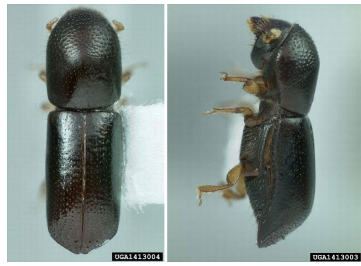
Figure 1. Redbay ambrosia beetles ( Xyleborus glabratus ): a) top view and b) side view of an adult.