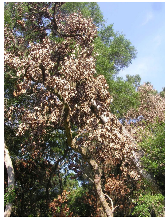
Figure 7. Whole redbay trees killed by redbay ambrosia beetle-laurel wilt pathogen attack.