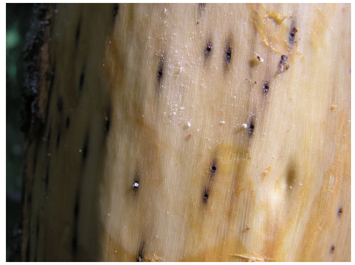
Figure 5. Bore holes are seen when the bark is removed from an infested limb or trunk. Note the dark staining of the sapwood caused by the feeding of the laurel wilt pathogen on the sapwood.

4. Leaf, stem, and limb dieback; eventual tree death (figures 6 and 7).