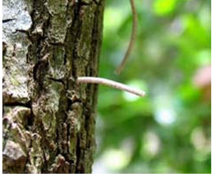
Figure 4. Small strings of compacted sawdust protrude from small bore holes along the trunk of a tree.