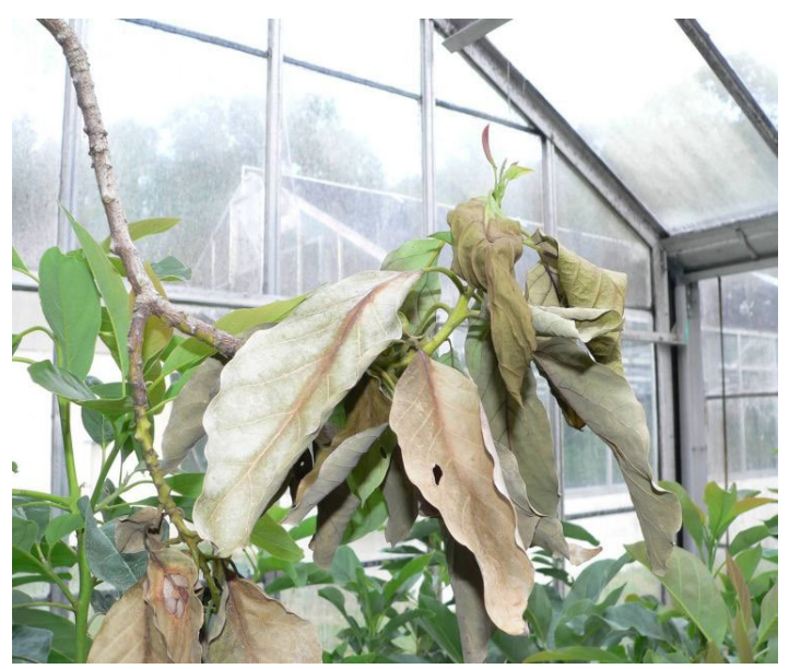
Figure 6. Wilted leaves and young stems of laurel-wilt-infected avocado trees.