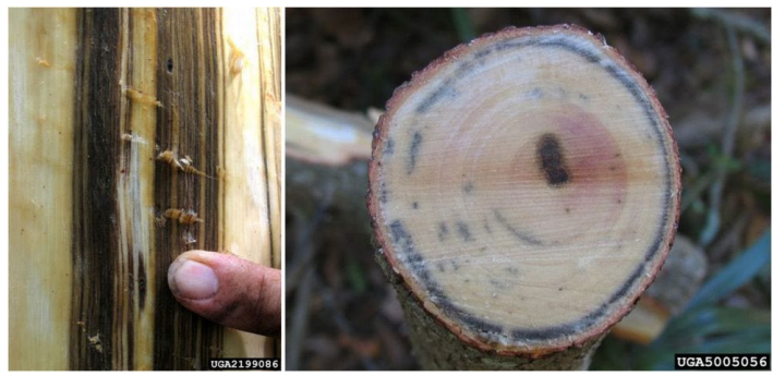
Figure 2. Symptoms of laurel wilt fungal ( Raffaelea lauricola ) colonization of redbay trees. a) Removing the bark reveals dark staining of the sapwood. b) The dark color of the outer ring of sapwood below the bark indicates the tree has been infested by the redbay ambrosia beetle and the wood has been colonized by the laurel wilt pathogen. The fungal hyphae, which have colonized sapwood, block movement of water and nutrients in the tree.

The adult female redbay ambrosia beetle carries in a special pouch in its mouth -- called a mycangia -- the spores of the fungus that causes laurel wilt ( Raffaelea lauricola ) (Fraedrich et al., 2008; Harrington et al., 2008). As the beetle bores into the wood, forming galleries, the spores carried in its mycangia and on its body inoculate the tree, germinate and grow, colonizing the outer wood (sapwood) of the host plant (Figure 2). The fungal hyphae and colonized sapwood block the movement of water and nutrients in the tree.