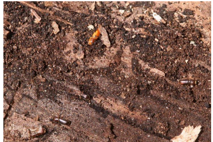
Fig. 1. Walnut twig beetle ( Pityophthorus juglandis ) 1

It may take several years of insect and fungal attack before symptoms are visible, starting with yellowing leaves and thinning tree crown. As the disease progresses, foliage wilts, larger branches die, and eventually the tree dies (Fig. 2) (Tisserat et al. 2009). Minute exit holes caused by the twig beetle can be found on the trunk (Fig. 3).