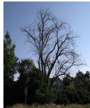
Fig. 2. 400-year old black walnut killed in northern Utah