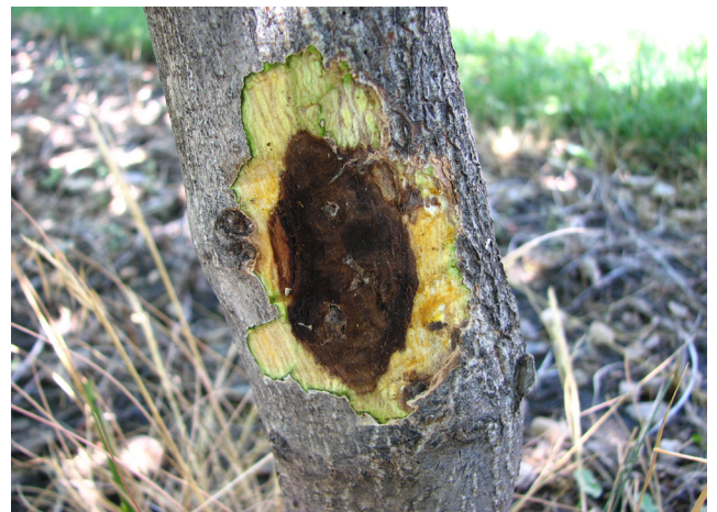
Figs. 4 a and b. Canker symptoms surrounding beetle galleries shown on the surface of the trunk (top) and just under the bark (bottom).