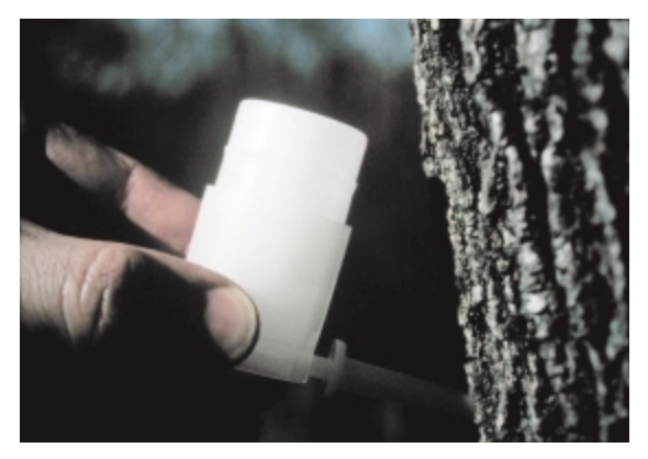
Figure 5 —Insecticides injected into trees via small injection capsules then spread systemically through the wood, killing insects infesting that wood.

Research to find better control options is ongoing. Scientists are experimenting with traps using sex attractants (pheromones)—an approach that has worked well for the gypsy moth-and using host-plant (tree) odors to aid in locating infested trees. Researchers are also studying the efficacy of insecticides delivered directly into host trees via small injection capsules.