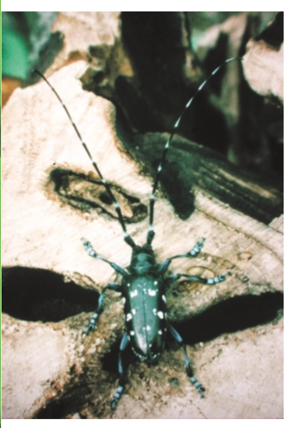
Figure 1 —This photo illustrates an adult Asian longhorned beetle and several holes bored by larvae.

The Asian longhorned beetle ( Anoplophora glabripennis ) has earned the title of pest both here and in its home country of China. This beetle is a serious threat to hardwood trees and has no known natural predator in the United States. If the Asian longhorned beetle becomes established here, it has the potential to cause more damage than Dutch elm disease, chestnut blight, and the gypsy moth combined, destroying millions of acres of America's treasured hardwoods, including national forests and backyard trees. The beetle has the potential to damage such industries as lumber, furniture, maple syrup, nursery, and tourism.