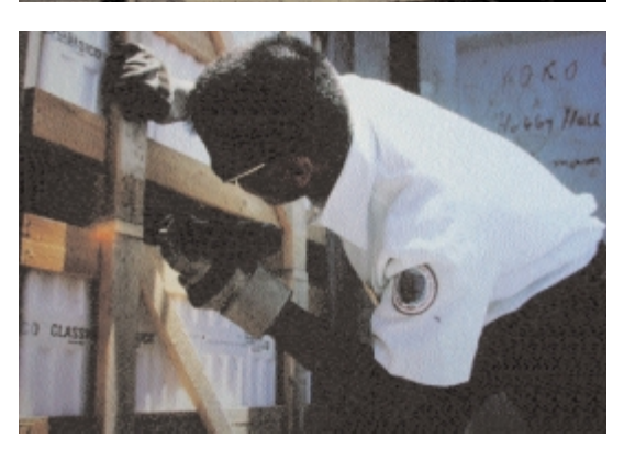
Figure 9—APHIS Plant Protection and Quarantine (PPQ) officers at U.S. ports are the first line of defense against exotic plant and animal pests and diseases.