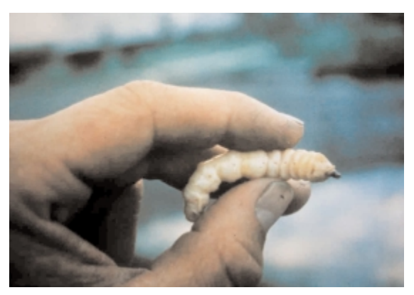
Figure 4—Asian longhorned beetle larva.

The Asian longhorned beetle's life cycle makes conventional insect eradication measures such as pesticides ineffective. Because the majority of the beetle's life is spent deep within the host tree, surfaceapplied insecticides are not an option. At present, the only effective method of eliminating the beetle is to cut, chip, or burn infested trees and replace them with nonhost species.