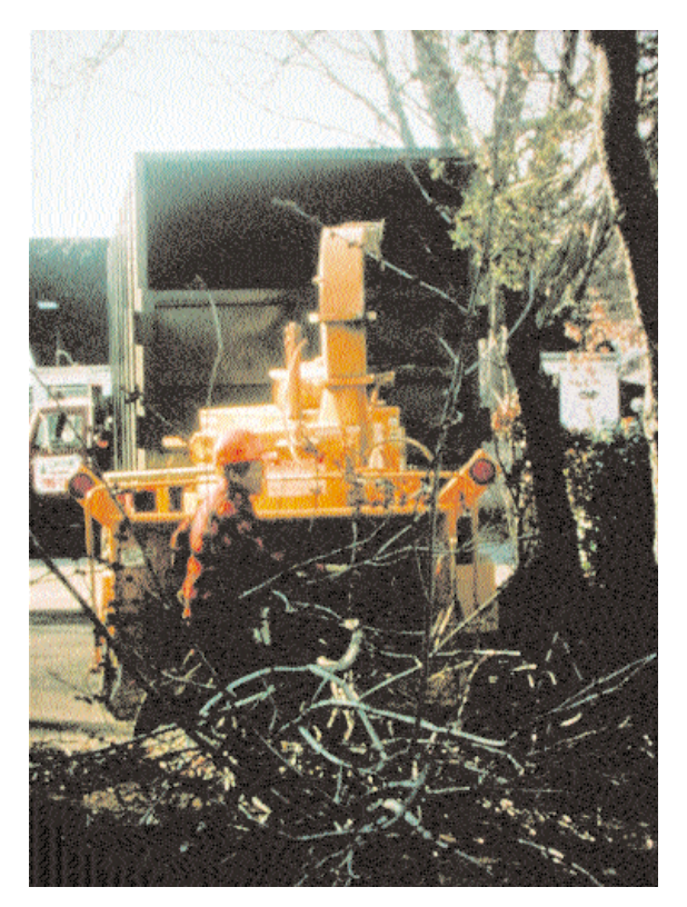
Figure 10—Currently, the only way to eradicate the beetle is to cut, chip, and burn infested trees.

The fight against the Asian longhorned beetle is hard work. USDA requests the help and cooperation of residents, business owners, and workers in identifying possible new infestations. reporting them to the authorities. and providing assistance to the Asian longhorned beetle eradication program. Citizens of New York and Chicago are encouraged to remain aware of signs of an infestation and