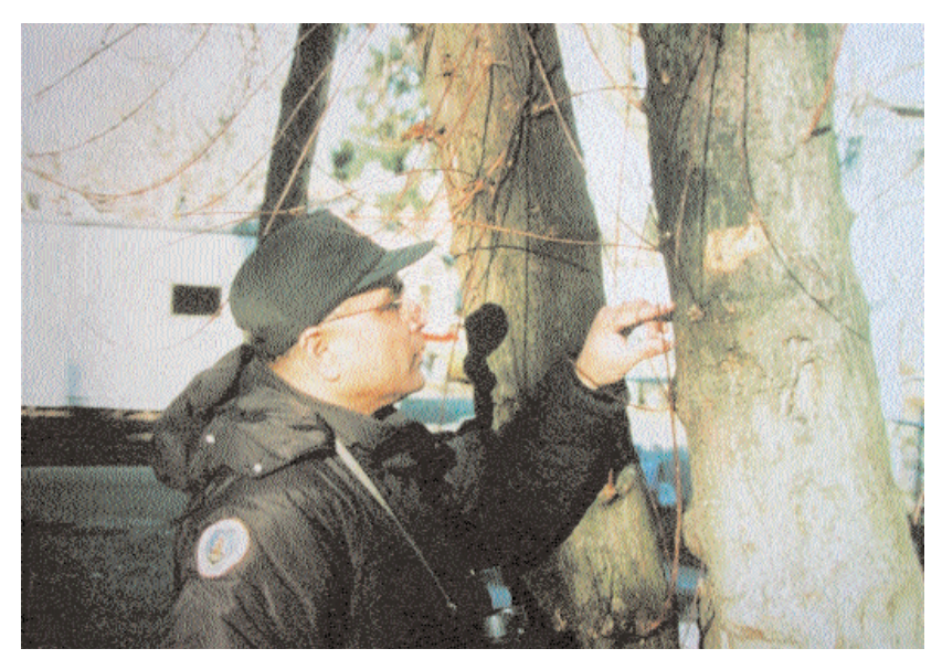
Figure 11 —APHIS inspectors, teamed with State and local cooperators, survey the quarantine area to look for infested trees.

For more information regarding the Asian longhorned beetle, reporting an infestation, SWPM, the insecticide used for tree injection, or quarantine limits and regulations, please visit www.aphis.usda.gov on the World Wide Web and click on the button for Asian longhorned beetle under "Hot Issues." To report a sighting of the Asian longhorned beetle, please contact your local USDA–APHIS office.