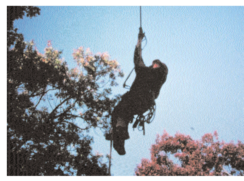
Figure 7 —In difficult areas, smokejumpers (forest firefighters) from the USDA Forest Service and the U.S. Department of the Interior's Bureau of Land Management climb trees to inspect for Asian longhorned beetles.

Inspectors utilize innovative methods to conduct Asian longhorned beetle surveys. Trained professionals perform aerial tree inspections using bucket trucks, and Forest Service and Bureau of Land Management smokejumpers (forest firefighters) climb trees in difficult areas. Ground observations involve the participation of many interest groups and organizations; however, anyone with a keen eye and set of binoculars can contribute to this effort.