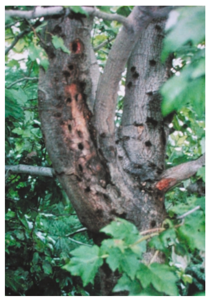
Figure 3—Asian longhorned beetle damage.