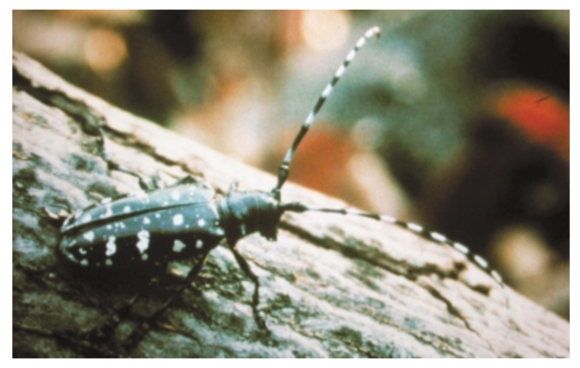
Figure 2 —If the Asian longhorned beetle becomes established here, it has the potential to cause more damage than Dutch elm disease, chestnut blight, and the gypsy moth combined.

Female Asian longhorned beetles chew depressions (oviposition sites) in the bark of trees to lay eggs. One female can lay 35 to 90 eggs. Hatching within 10 to 15 days, the white, wormlike grubs develop into caterpillars (larvae) and tunnel just beneath the tree bark in the cambium layer. They feed in the cambium for several weeks before entering woody tree tissue (xylem). There the larvae continue to feed and develop during the winter. Beetle larvae pupate through the spring inside host trees. During summer, the adult beetles emerge, mate, and feed on the bark of small twigs for several days. Adult beetles remain active only during summer and early fall months before perishing.