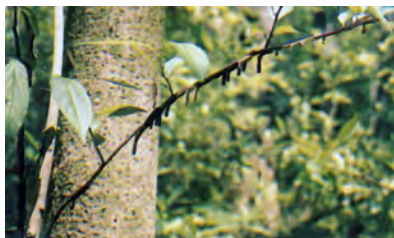
Figure 10.—Flooding of tupelo swamps during the larval feeding period prevents natural enemies from reaching the forest tent caterpillars.