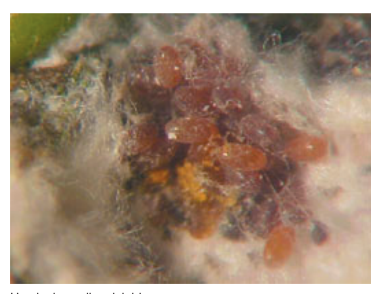
Hemlock woolly adelgid egg mass.