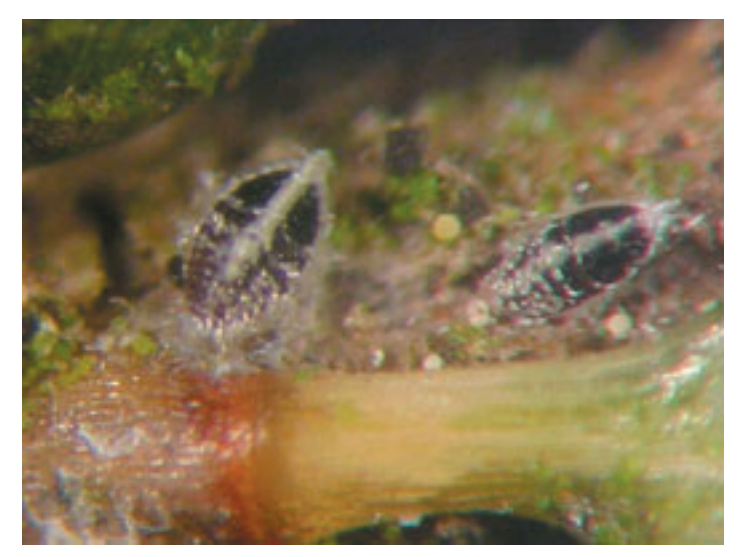
Hemlock woolly adelgid nymphs are black with white, waxy fringes.

of needles. They soon extrude the white, fluffy "wool" that covers their bodies. About half of the resulting adults have two pairs of wings and will fly off in search of an alternate host of spruce on which to feed. Because no suitable spruce host occurs in North America, the adelgids will eventually die of starvation. The other half are wingless and remain on the tree, where they lay eggs in a fluffy mass on the hemlock.