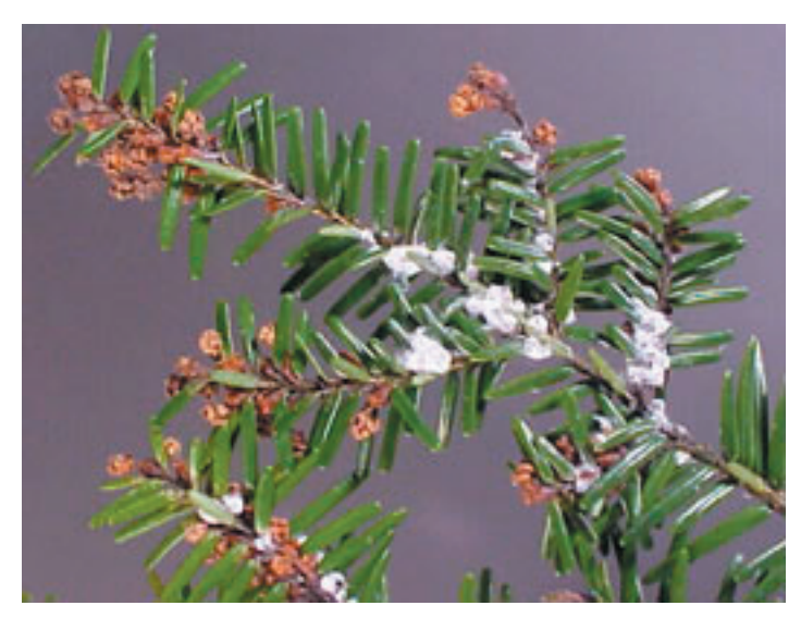
White, waxy fluff covers the hemlock woolly adelgids on a twig.