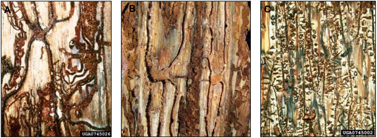
Fig. 3. Galleries in the inner bark characteristic of A) I. calligraphus ; B) I. grandicollis ; C) I. avulsus . Photography credits: Ronald F. Billings, Texas Forest Service (A,C); Jeffrey M. Eickwort, Florida DOACS (B). Images A, C accessible at http://www.forestryimages.org