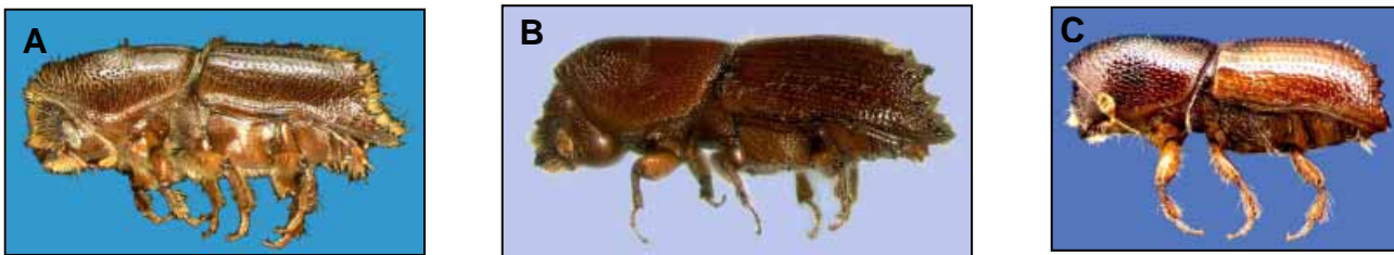
Fig. 1. Adult Ips beetles. A) I. calligraphus (Germar); B) I. grandicollis (Eichhoff); C) I. avulsus (Eichhoff).

DISTRIBUTION: All three Ips species can be found throughout Florida in areas where pines occur. Ips calligraphus has two recognized subspecies, I. c. calligraphus , found throughout much of the eastern US, north to southern Ontario, Canada, and I. c. ponderosae , a western US subspecies. The distributions of both I. c. calligraphus and I. grandicollis north of the southern pines coincide with the range of pitch pine ( Pinus rigida Mill), although they will affect any pine species within that range. I. avulsus is restricted to the southeastern states, from southern Pennsylvania to Florida and Texas (USDA Forest Service 1985).