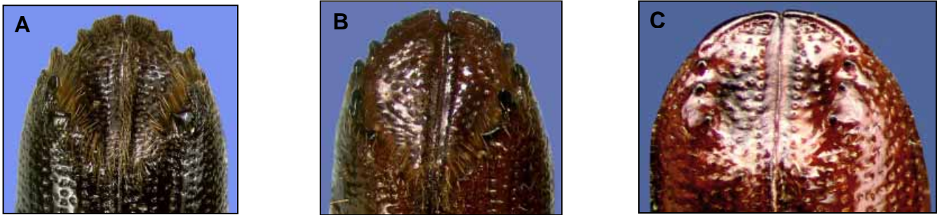
Fig. 2. Dorsal view of the elytral apices. A) I. calligraphus ; B) I. grandicollis ; C) I. avulsus.

HOSTS: All three southern Ips species can infest any pine species within their range, and occasionally other conifers such as spruce, hemlock, and fir. Common hosts in Florida include loblolly pine ( Pinus taeda L.), longleaf pine ( P. palustris Mill.), pond pine ( P. serotina Michx.), sand pine ( P. clausa (Chapm. ex Engelm.) Vasey ex Sarg.), shortleaf pine ( P. echinata Mill.), slash pine ( P. elliotii Engelm.), and spruce pine ( P. glabra Walt.).