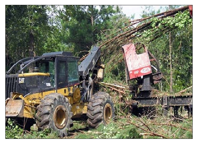
Figure 5. Skidder distributing slash from a loading deck into a thinned pine stand.

exposes it to moisture, light, wind, and temperature variability. All of these factors can lessen the suitability of slash material for Ips beetles. Slash distribution is very feasible for logging crews. After delivering a load to the deck, the skidder picks up a load of slash material and deposits it along skid trails and thinning rows/corridors while retrieving the next load (Figure 5). Spreading potential Ips beetle habitat throughout your residual trees may seem strange, but logging equipment passing back and forth and exposure to the elements will make most redistributed slash less suitable for Ips . Slash distribution may also provide some protection against soil compaction from logging equipment. If slash redistribution is not possible or desired, residual slash piles can be burned. However, if burning is employed, take care to ensure residual trees are not scorched.