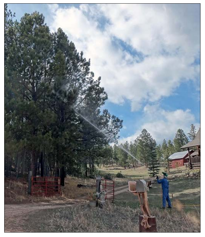
Figure 4. Ips prevention through chemical application on highly valued residential trees.

nonindustrial private landowners for stand-level treatments. However, these treatments may be cost effective for highly valued trees in residential areas ( Figure 4 ). Additionally, they are not very effective at killing Ips once they have actually infested a tree. Most importantly, a heavily infested tree will likely die anyway and cannot be saved by insecticides. Insecticides should, therefore, only be used as a preventive measure to control Ips damage in weakened, wounded, or stressed high-value trees before infestation occurs. Supplemental watering of pine trees growing in residential areas during periods of drought is also useful in preventing Ips attacks.