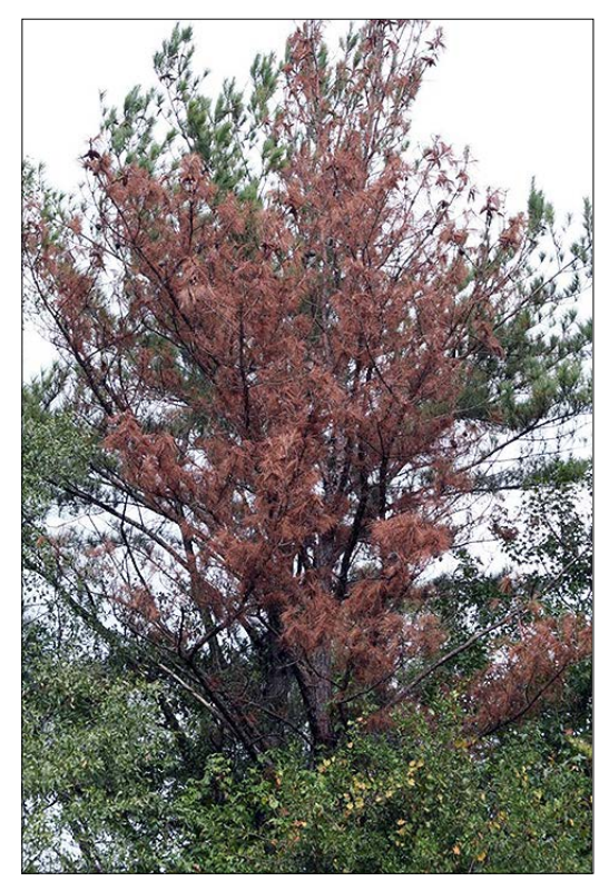
Figure 2. Dead and fading tree killed in an Ips infestation.

Ips infestations typically do not appear in defined "spots," as SPB infestations typically do. Ips tend to cause scattered mortality of only the weakest trees throughout stands. Consequently, Ips damage is generally distributed in a much more scattered pattern throughout a pine stand compared to that of the SPB. In many cases, the damage a stand suffers from an Ips infestation is limited to only one or a few trees (Nebeker 2004). If Ips do persist, they are likely to create a checkerboard pattern of fading and healthy trees (Stone et al. 2007; Figure 2 ). This pattern is dramatically different from SPB infestations, which can continuously spread from the initially attacked tree unless environmental conditions or management activities halt beetle activity.