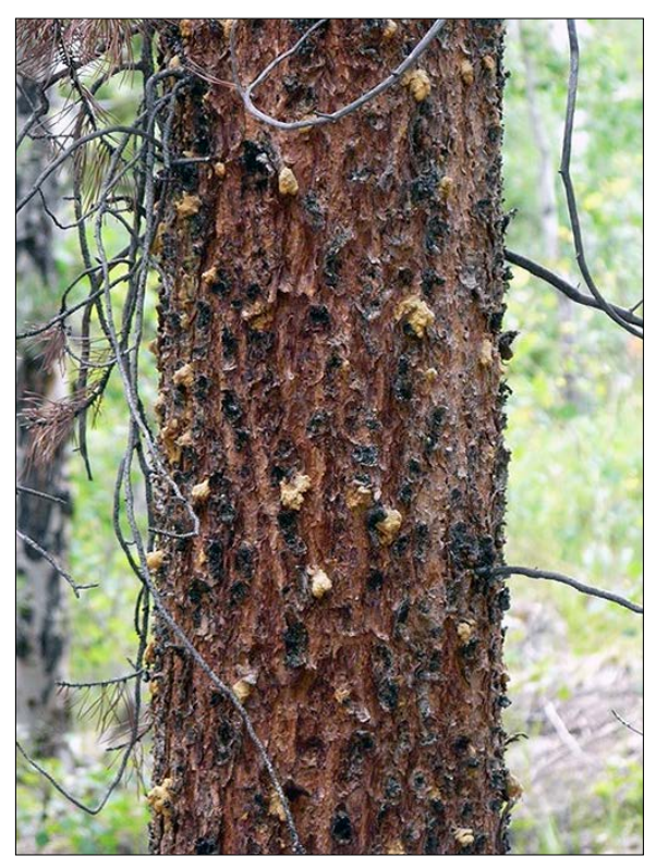
Figure 3. Pine bark beetle pitch tubes.

al. 1980, Clark and Nowak 2009). However, Ips beetle infestations are often randomly distributed throughout a stand, making these operations less feasible for Ips control. Additionally, Ips rarely kill healthy pines and do not generally cause large-scale tree mortality over large acreages. For these reasons, proper Ips management is typically different from SPB management. In fact, more often than not, letting individual Ips infestations run their course may be the most economical option.