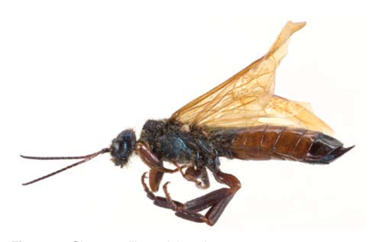
Figure 2. Sirex noctilio—adult male.