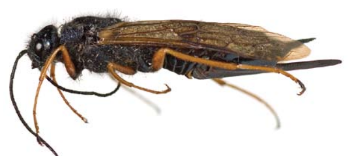
Figure 1. Sirex noctilio—adult female.

by an insect taxonomist. Therefore, collect and submit any suspect woodwasps to your county extension or state Department of Agriculture office.