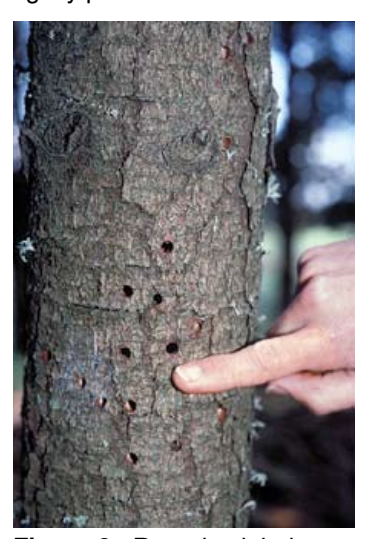
Figure 8. Round exit holes.