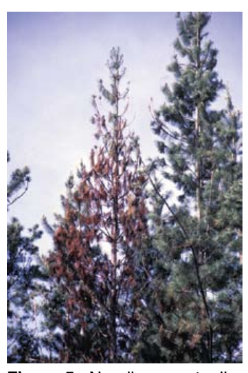
Figure 5. Needles eventually turn red.