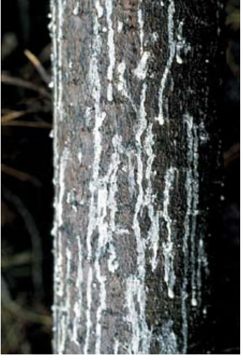
Figure 6. Resin beads and dribbles at egg-laying site.