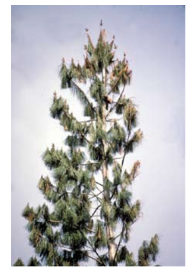
Figure 4. Green needles wilt and point straight down.