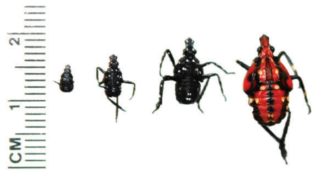
Fig. 2. L. delicatula passes through four nymphal instars. The first three instars (left to right) are black and ornamented with spots. The fourth instar develops red patterning on the dorsal side that covers in part the head, thorax, and abdomen, while still retaining some white spotting.