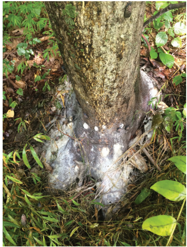
Fig. 7. Mold growing at the base of A. altissima . Large amounts of bleeding sap will accumulate on tree bases leading to growth of saprophytic fungi, or in extreme cases, thick mats of fungal growth.

There appears to be potential to use attractants and repellants to develop improved traps for monitoring or control purposes, although to our knowledge this has not been tested. In the laboratory Moon et al. (2011) reported that both nymphs and adults were highly attracted to spearmint oil at low doses (5 \mu l), which could be used to augment their control. Lee and Park (2013) also demonstrated attraction of this insect to a methanol extract of its preferred host A. altissima . Jang et al. (2013) reported that this species had a preference for lights with shorter wavelengths such as UV and blue lights. Yoon et al. (2011) evaluated several essential oils for repellency against L. delicatula . Only lavender oil