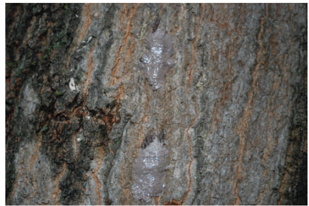
Fig. 1. Egg masses of L. delicatula covered by waxy deposits.

Adults and nymphs feed on phloem tissues of young stems and bark tissues with their piercing and sucking mouthparts and excrete large quantities of liquid (Ding et al. 2006). Adults and older nymphs will feed in groups, especially later in the season on preferred hosts.