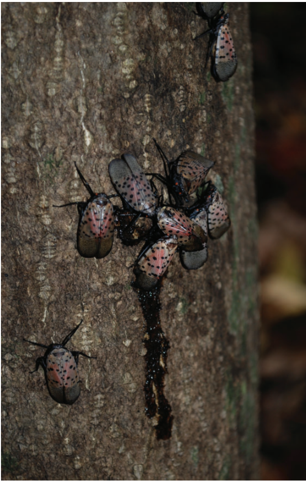
Fig. 6. Aggregation of L. delicatula on A. altissima . The dark liquid is tree sap oozing from feeding wounds caused by L. delicatula .

against L. delicatula . Pyrethrum, Sophora , and neem extracts (at 1,000 fold dilution) killed \geq 95\% of adults within 48 h, but the extracts tended to be less effective against nymphs in some tests (Lee et al. 2011, Choi et al. 2012). Control with reduced risk materials may be preferred in many urban or environmentally sensitive areas and will help reduce impact to beneficial species, but presumably requiring good coverage.