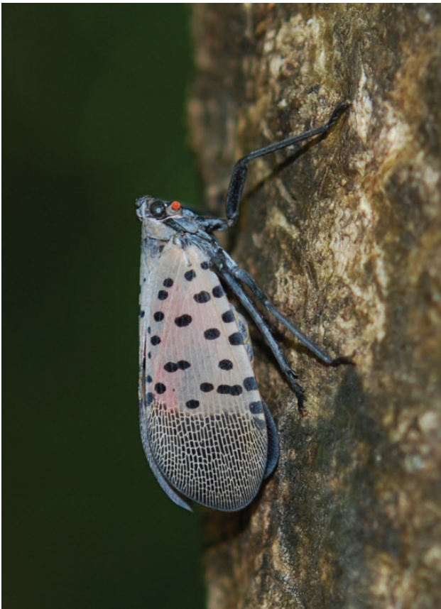
Fig. 4. Lateral view of a resting adult L. delicatula on A. altissima .

It is unclear to what extent natural enemies will control L. delicatula in North America. Natural enemies of other planthoppers in