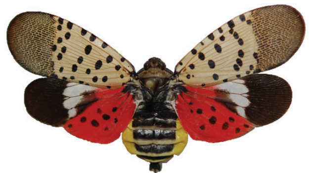
Fig. 3. Dorsal view of an adult female L. delicatula . The colorful hindwings and the black and yellow abdomen are not visible at rest.

Extensive feeding results in oozing wounds on the trunk (Fig. 6) and wilting and death of branches. Significant honey dew and sooty mold deposits around the base of trees are also noted from feeding of this insect (Fig. 7). Signs of infestation include the presence of ants, bees, hornets or wasps attracted by honeydew and tree sap.