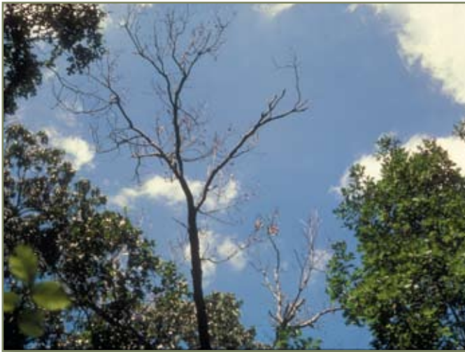
Mortality associated with oak decline.