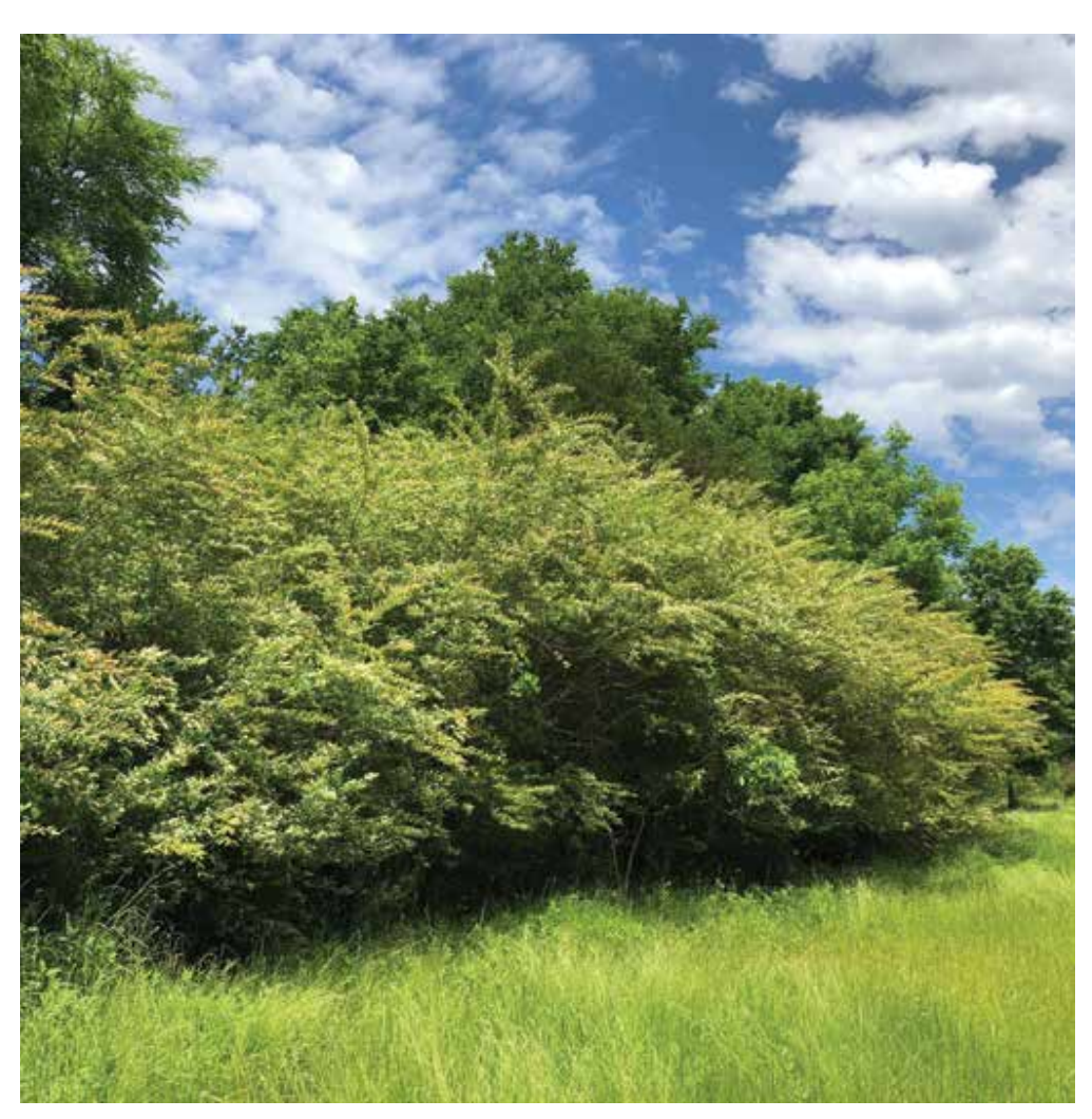
This wall of privet, blooming in Broken Bow, Oklahoma, could be controlled with an application of glyphosate.

through this review, and lest some suggest there's a political aspect to this sort of thing, it's worth pointing out that the EPA under Presidents Clinton, Bush, Obama, and Trump all found glyphosate, when used according to label directions, posed no risk to human health and was not a carcinogen.