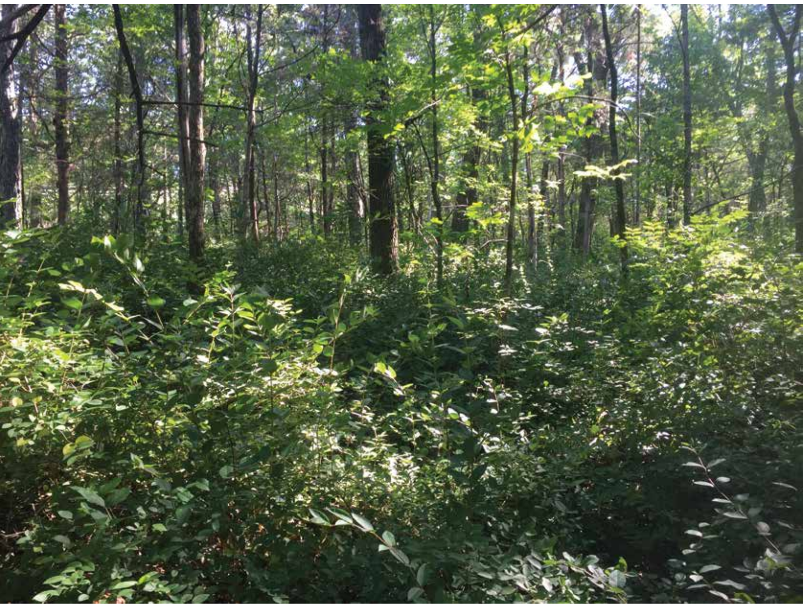
This forest understory in Huntsville, Alabama, is dominated by invasive honeysuckle, which is typically controlled by glyphosate..

camping? Then eliminate the invasive species that can turn your scenic woods into a dense, green carpet.