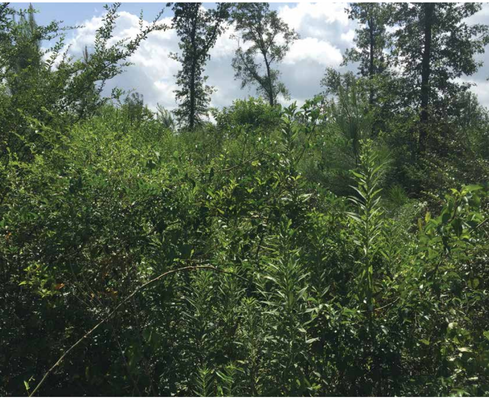
Invasive vegetation has taken over a young pine stand in Nacogdoches, Texas. Glyphosate is an effective weapon for forest landowners against invasives.

Let's be clear: a dangerous product should not be on the market. But there is no scientific evidence to suggest glyphosate is dangerous when used appropriately. Yes, there are risks in using pesticides. There are also risks from driving an automobile and excess sun exposure. It's all about minimizing that risk and taking proper precautions.