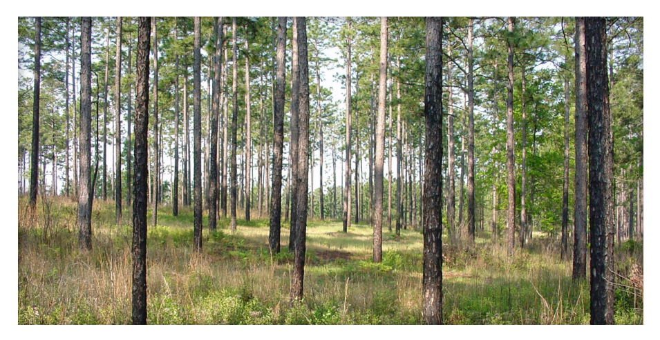
Figure 1. This healthy longleaf pine (Pinus palustris) stand has been thinned, and understory vegetation has been managed with prescribed burning. Stands such as these have abundant wildlife, diverse vegetation, and help clean our water and air.

AUTHORED BY: DAVID COYLE AND MARK MEGALOS