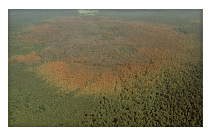
Figure 2. The southern pine beetle (Dendroctonus frontalis) is capable of killing thousands of trees if outbreaks occur. In this photo from the Sabine National Forest in Texas, the gray loblolly pine (Pinus taeda) trees in the middle are dead, the red trees closer to the outside are recently killed, and the yellow trees are dying. In this case, the southern pine beetle outbreak appears to be expanding outwards in all directions.

High-grading, another past land management practice is the practice of harvesting the largest, often best quality trees and leaving the small and lower quality trees. High-grading is prevalent in stands with mixed (multiple different) species and continues today as "diameter-limit cutting." When repeated, high-grading results in stands of slow-grow-