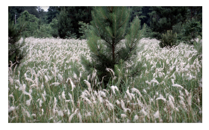
Figure 3. Cogongrass (Imperata cylindrica) is a non-native weed capable of outgrowing native vegetation and taking over large areas. The trees in this photo will likely survive, but will have to compete with the cogongrass for water and nutrients, and probably won't grow as quickly as they normally would.