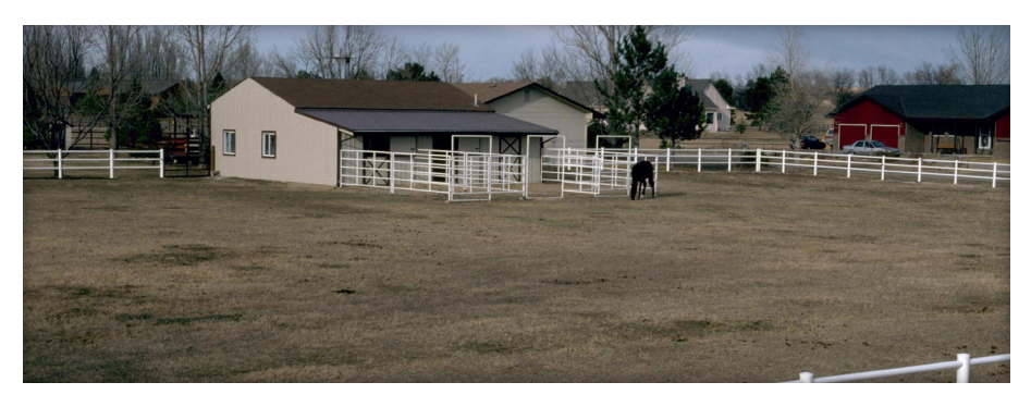
Figure 6. When animals are allowed to graze so much so that the grass cannot grow fast enough, the land can become damaged and may not grow back. This can lead to soil erosion, especially if it occurs on a slope, as grass or other vegetation will no longer be able to buffer flowing water after a rain.