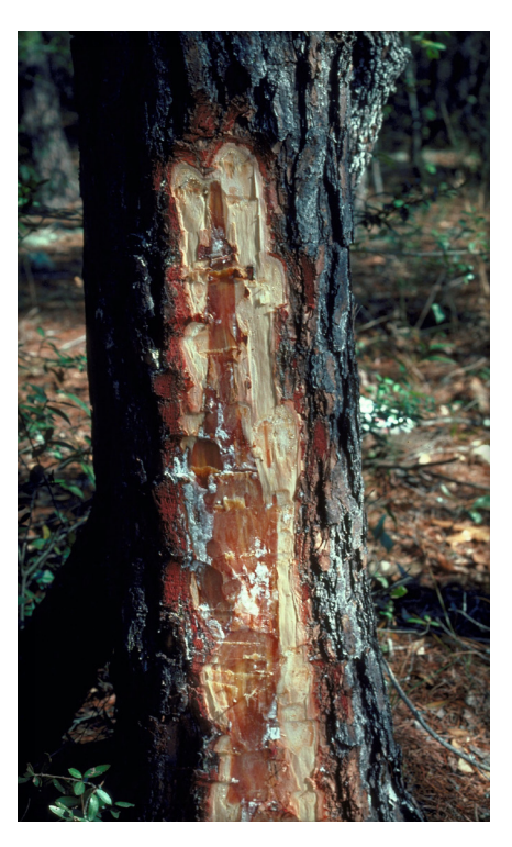
Figure 5. Damage from logging equipment can scrape the bark off trees, causing large wounds that may be infected by fungi or attacked by bark and woodboring insects.

Wildfire, if severe enough, will injure, stress or kill trees (Fig. 9). These trees, if they survive, will be left susceptible to various types of insects and diseases. Insect damage after a fire may result in tree death. Also, very hot fires can kill tree roots, damage the soil, and hinder its ability to support new growth.