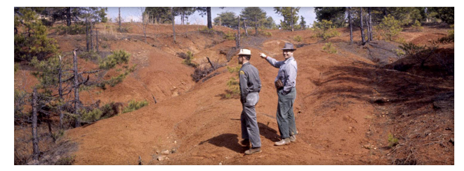
Figure 4. Soil erosion, in this case from poor drainage that caused deep gullies and washed away much of the topsoil, can create difficult growing conditions for trees.