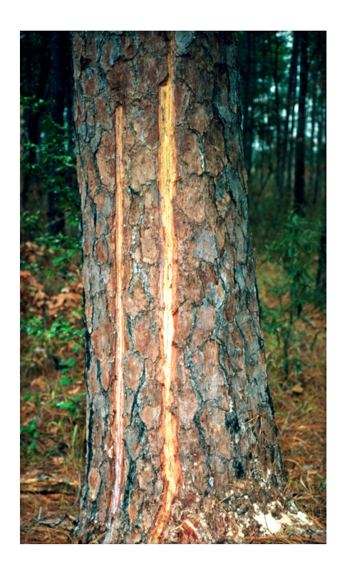
Figure 7. Trees struck by lightning don't always die, but the wounds created can attract bark and woodboring insects. These insects may colonize the tree, and are capable of infecting the tree with fungi.