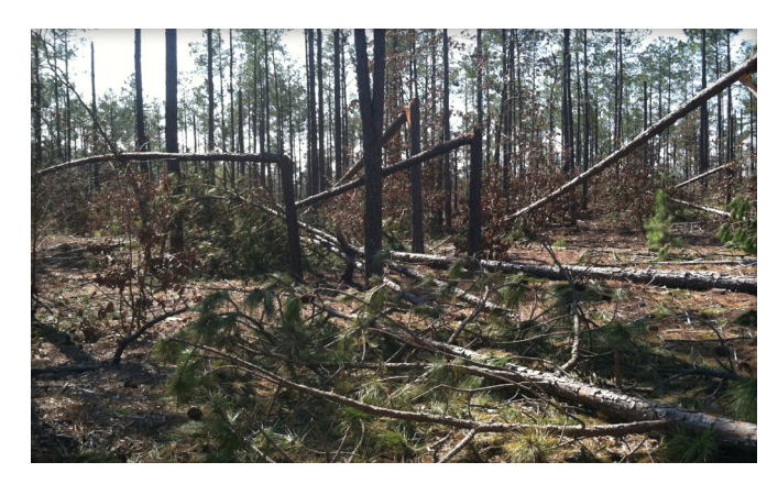
Figure 8. During storms, snow and ice can accumulate in tree tops and cause stems to break. In this stand in South Carolina, several trees have snapped because the tops became too heavy from ice accumulation during a storm in 2014.