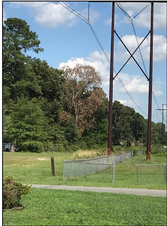
Sand post oak ( Q. margaretta ; left) and Southern red oak ( Q. falcata ; right), both succumbed water stress caused by excessive rainfall followed by a “flash drought”.