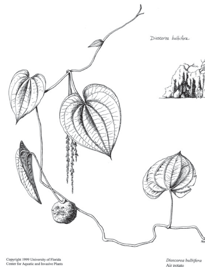
Figure 3. Air potato ( Dioscorea bulbifera ).

invasive species. Climbing up to 80 ft. in length, stems are square in cross section with “winged” corners that are often red-purple tinged, and twine to the right (clockwise). Winged yam has opposite leaves that are more triangular and larger than those of air potato. Figure 5 shows air potato and winged yam growing alongside each other. Though not as widespread as air potato, winged yam nonetheless ranges from Escambia to Miami-Dade counties ( http://www.plantatlas.usf.edu/maps.asp?plantID=1750 ), and is probably more widespread than has previously been recognized. Winged yam can produce massive edible tubers (Figure 6), some of which have been recorded to weigh over 100 pounds.