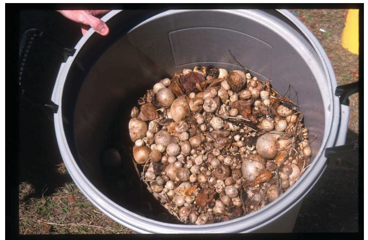
Figure 7. Remove air potato bulbils and other plant material from site and dispose of in such a way that they do not spread the vines to new areas.

As many bulbils as possible must be removed from the site (Figure 7). Those which remain will produce new vines. All plant material including bulbils must be disposed of in such a way that they do not spread the vines to new areas (for example, in a landfill where they will be incinerated). Plants become dormant in winter (during short day-length). Locating and removing bulbils is easier during winter months when air potato and other vegetation are not as dense as during summer. Air potato bulbils cannot tolerate freezing, and overnight in a freezer is the best way to prevent them from starting new infestations.