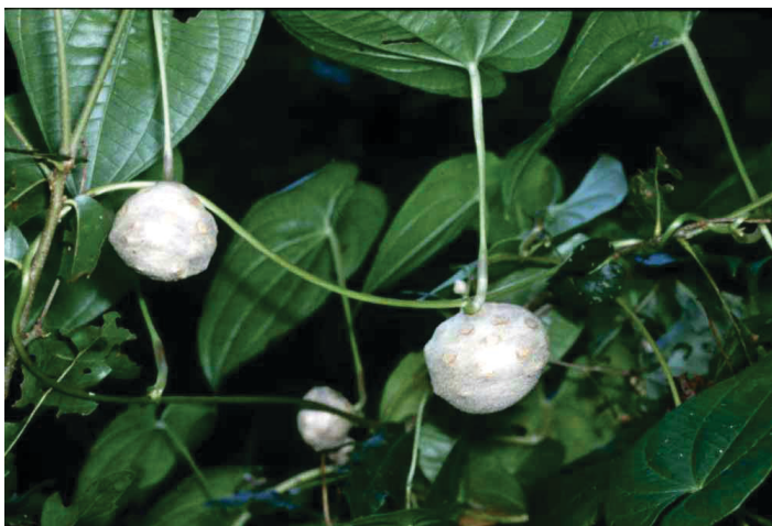
Figure 2. Air potato bulbils form in leaf axils.

Air potato is a vigorously twining herbaceous vine, often arising from an underground tuber. Freely branching stems grow to 60 ft. in length. Stems are round or slightly angled in cross section and twine to the left (counter-clockwise). Aerial tubers (bulbils) freely form in leaf axils (Figure 2). Bulbils are usually roundish with mostly smooth surfaces, and grow up to 5 in. x 4 in. (Figure 2). Leaves are long petioled (stalked), alternate; blades to 8 in. or more long, broadly heart shaped, with basal lobes usually rounded and with arching veins all originating from one point (Figure 3, Figure 4). Flowers are rare (in Florida), small, and fragrant, with male and female arising from leaf axils on separate plants (i.e., a dioecious species) in panicles or spikes to 4 in. long (Figure 4). Fruit is a capsule; seeds are partially winged.