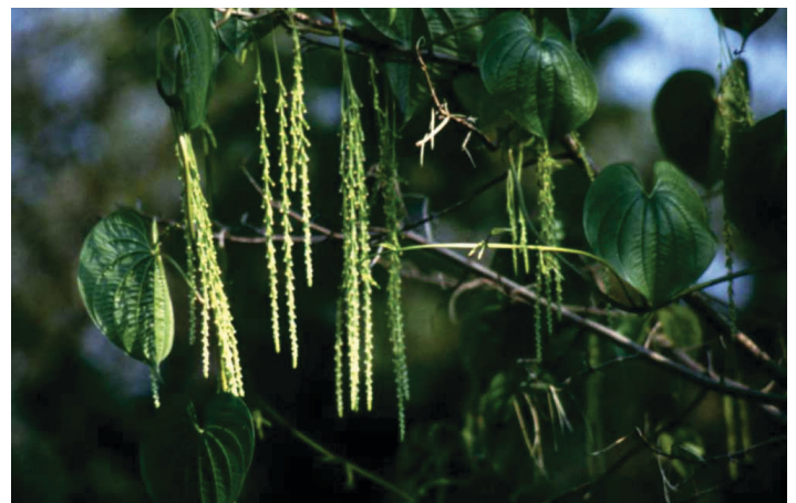
Figure 4. Air potato flowers.

Three other introduced species of Dioscorea may be encountered in Florida: Chinese yam ( D. polystachya ), Zanzibar yam ( D. sansibarensis ), and wild yam ( D. villosa ). None of these is considered to be invasive. Our native wild