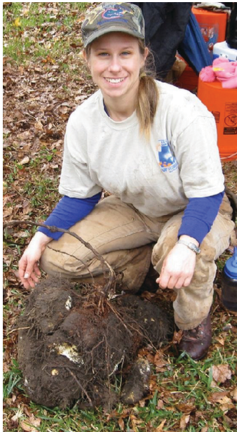
Figure 6. Underground tuber of winged yam.