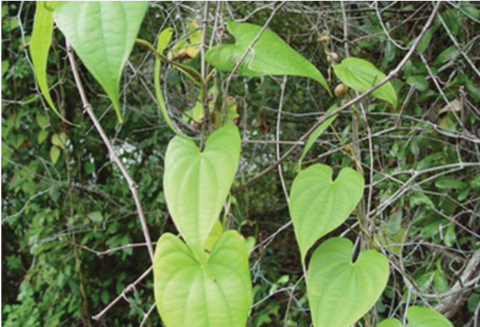
Figure 5. Side-by-side comparison of winged yam (left) and air potato (right).

yam ( D. floridana ) is infrequent in hammocks and flood-plains of northern and western Florida, never forms aerial tubers, and has leaf blades that rarely reach 6 in. long.