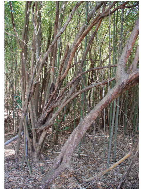
Figure 2. Golden bamboo can even outcompete and crowd out Chinese privet, another invasive species prevalent throughout the southeastern U.S., and one known for forming dense thickets.

Cut stems can be treated with systemic herbicides such as glyphosate or imazapyr, but multiple applications are typically required. Foliar sprays may suppress growth but are difficult