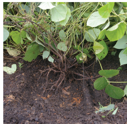
Figure 3. Kudzu roots grow down from a root crown located on the soil surface.

By the early 1950s, kudzu had largely become a nuisance. It