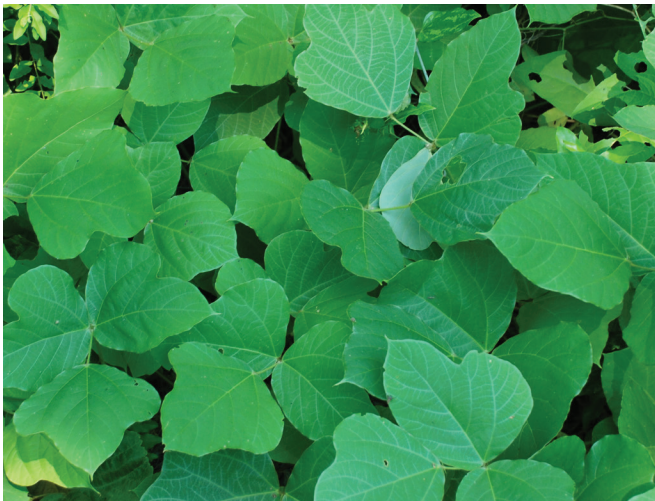
Figure 1. Kudzu has trifoliate leaves. Each of the three leaflets is usually slightly lobed and has a pointed tip.

Kudzu is also a serious weed of urban forests, and homeowners often struggle to effectively control its aggressive growth. Kudzu can quickly overtake any type of vegetation and suppress or kill it by heavy shading. Given the problems it causes, many people often question how such an invasive plant could have been purposefully introduced. This publication provides a short history of kudzu in the Southeast and explains the reasons behind the problem it has become.