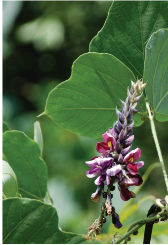
Figure 4. Kudzu flowers are typically produced on plants that are climbing or draped over vegetation or other objects. Note the kudzu bugs at the base of the flower.

had spread rapidly throughout the South because of the long growing season, warm climate, plentiful rainfall, and lack of disease and insect enemies. Abandonment of farmland during this time contributed to the uncontrolled spread of kudzu. In 1953, the United States Department of Agriculture removed kudzu from the list of cover plants permissible under the Agricultural Conservation Program.