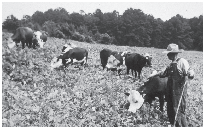
Figure 6. During the 1900s, kudzu was promoted as an inexpensive forage and for erosion control.

The history of kudzu in the United States is a compelling story, but also a cautionary tale of how good plants can go bad. Although scientists now use risk assessment tools to evaluate the potential for invasiveness in new plant introductions, it is still an imperfect process, and there is much yet to be learned. Without a doubt, kudzu is here to stay. Although landowners can get effective kudzu control, eradication from the United States is not currently feasible. It is clear that kudzu is continuing to expand its range in the United States and has yet to reach its ecological potential. Future research will help clarify the full impacts of kudzu and what can be done about it.