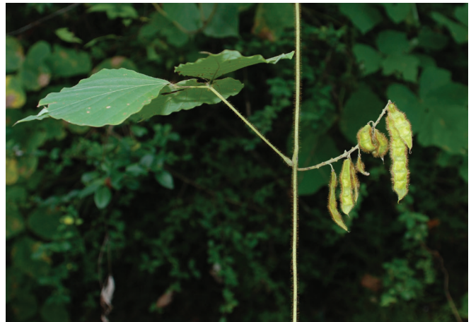
Figure 5. Kudzu fruits are flattened seed pod legumes.

Although kudzu is widely assumed to have significant negative ecological impacts, the influence of kudzu on biodiversity and ecological processes are surprisingly poorly studied. Anecdotal reports and general observations suggest that the dense shading created by kudzu significantly reduces native plant biodiversity. Kudzu growing in forest plantations can weigh down and smother seedlings and saplings. Larger