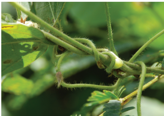
Figure 2. Young kudzu vines are covered with erect golden hairs and climb by twining.

Kudzu blooms from July through September. The fragrant, pealike purple flowers are typically produced on plants that are climbing or draped over vegetation or other objects, as vines rarely flower when trailing on the ground. Flowers are followed by flat, hairy seed pods; however, seed production and viability are highly variable. Seeds mature on the vines in October and November. Longevity of seeds in the soil is not known. Because the seeds have very hard coats, it is thought that those that don't succumb to predation may lie dormant in the soil for several years before they germinate.